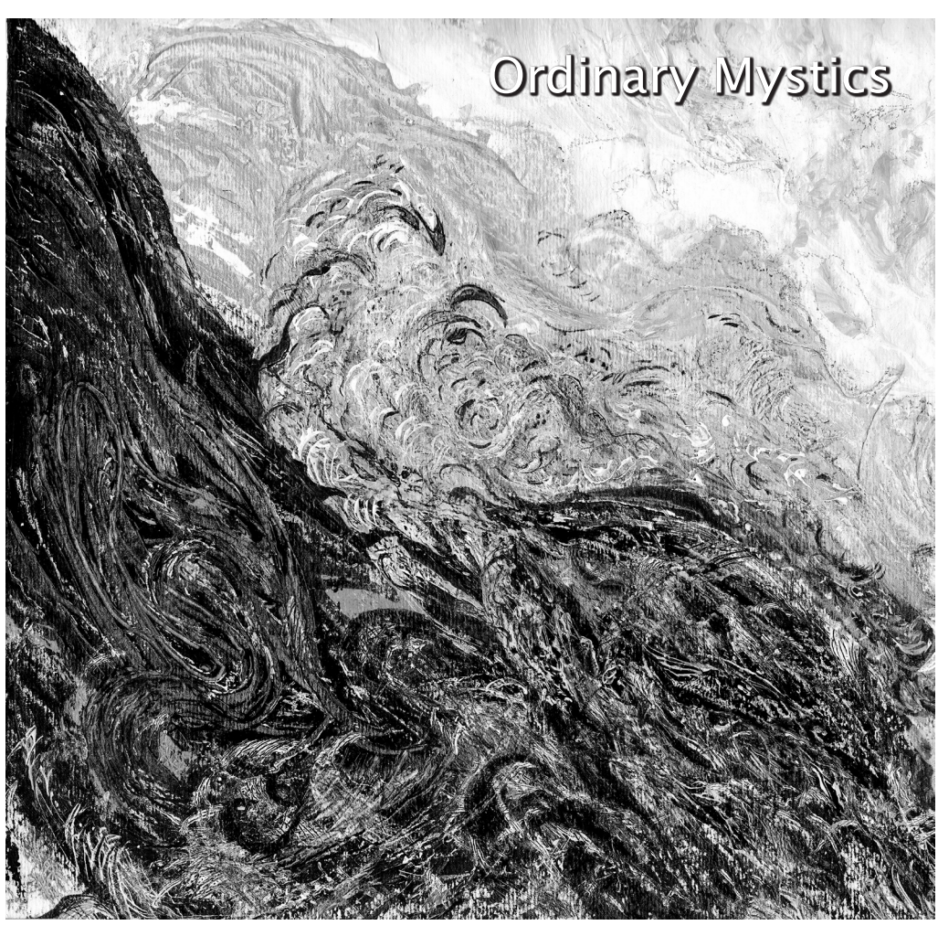
"Surge" Painting and poem by Claire Bateman

"Restraint" The work of water is to taste like nothing. The work of wind is to look like nothing. The work of fire is to billow in the bloodstream, impersonating nothing even as it burns.